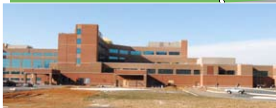
Emergency Department entrance