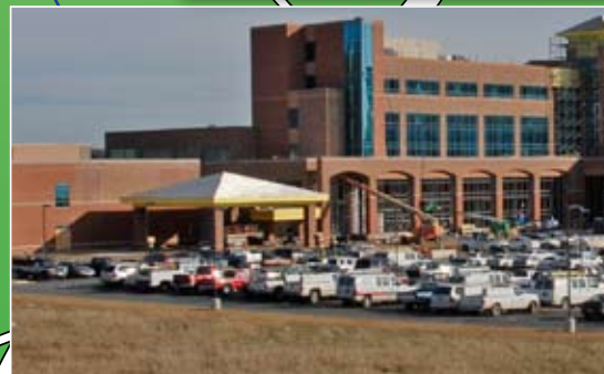
Heart and Vascular Center entrance