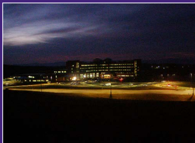
This image from the RMH Web cam was captured Feb. 11 at 6:42 a.m. To view a photo from any date or time after March 2007, simply use the sidebar available on the Web cam page.

Or go back several months, or years, and see how much has changed—in just a matter of seconds! If you're feeling adventurous, click "Time Lapse," and watch the entire RMH construction project unfold, from beginning to present, in a mini-movie.