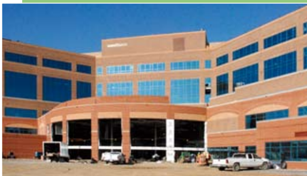
Mountain View Café entrance