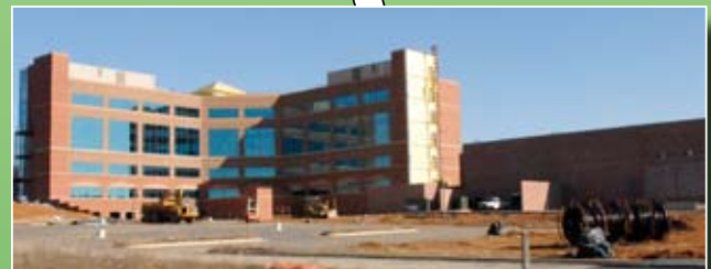
Loading docks and employee entrance