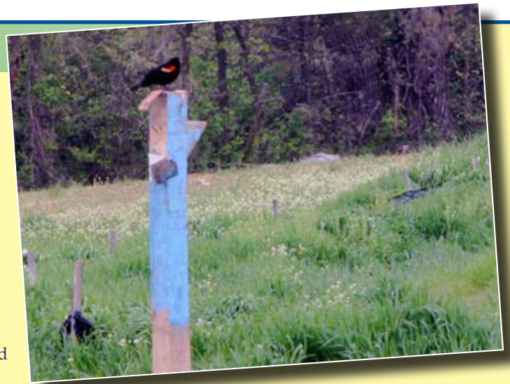
Above: A red-winged blackbird, native wetland inhabitant, seen on the new RMH health campus. RMH and JMU students are collaborating to preserve the natural habitats surrounding the new hospital.

JMU students will continue to monitor the site and research potential long-term benefits to this type of land management, he said. This effort took place through the RMH-JMU Collaborative, which will mark its second anniversary in April.