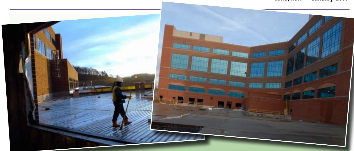
Left: A construction worker makes his way across the cafeteria roof. Right: A view showing the southwest side of the new hospital building.